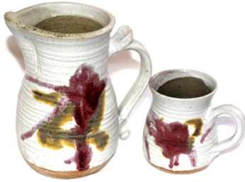
4. Copper red