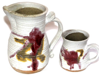
2. Copper Red