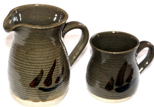
4. Galway Hooker